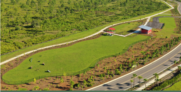
Bark Park - Open Aug. 24, 2024