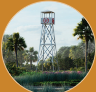
The Fire Tower