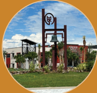
The Bell Tower