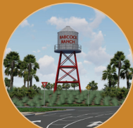
The Water Tower