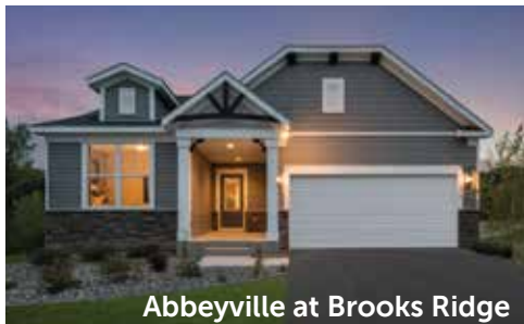
Abbeyville at Brooks Ridge

Visit Pulte.com for more information on these home designs.