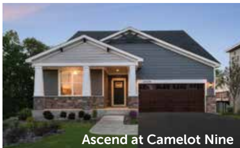
Ascend at Camelot Nine